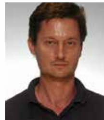
Igor Kopal EFEE President

Finally please let me point out one more time the importance of EFEE 9th World Conference on Explosives and Blasting and I'm really looking forward to meeting you all in Stockholm from 10th - 12th September 2017.